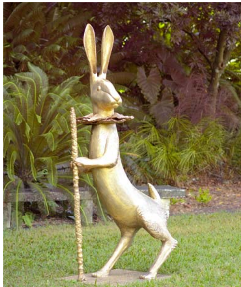
Claude Lalanne Nouveau Lapin de Victoire (grand) 2010