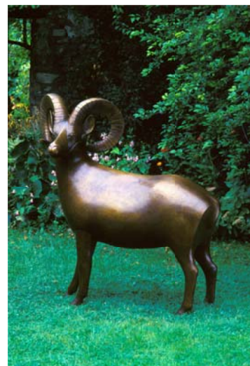
François-Xavier Lalanne Mouflon de Ram Island (grand) 1999

Sotheby's S|2 selling exhibition follows Kasmin and Shvo's groundbreaking public art exhibition, Sheep Station , at the former Getty filling station in West Chelsea. The pair placed 25 sheep sculptures by François-Xavier Lalanne, along the suddenly-grassy surface of a former gas station at the corner of 24th Street and 10th Avenue, a site now owned by Shvo and slated to become luxury residences. Sheep Station is open to the public through 20 October, just before the S|2 exhibition opens, affording both new and seasoned Lalanne enthusiasts the opportunity to join in the appreciation of this celebrated duo's work throughout the autumn season.