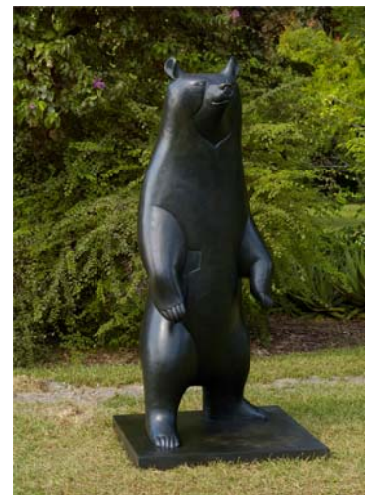
François-Xavier Lalanne La Grande Ourse 1994