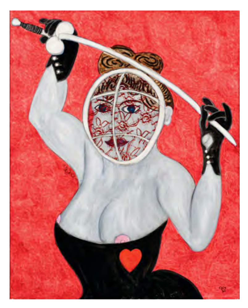
William N. Copley, En Garde , 1962, oil and lace on canvas, 32" x 25¾". ©2016 Estate of William N. Copley, Copley LLC, and Artists Rights Society (ARS), New York/The Menil Collection, Houston.

The non-narrative "Nouns," based on images from vintage Sears and Roebuck catalogues, depict ordinary consumer goods set against brightly colored, patterned grounds. The similarly non-narrative "X-Rated" paintings, based on images from hard-core porn magazines, show couples having sex on brightly colored, patterned beds, sofas, and floors. In the first series, a boxing glove takes on the aura of a fetish, while the relations between a French horn and a piano stool have a carnal flavor. In the second series, the eroticism of the images is overshadowed by their gorgeous hues and over-the-top decorativeness, as in a painting of a man (in a '70s patterned shirt) and a woman (in a lacy bodysuit) entangled in the corner of a sofa—whose green-and-white plaid upholstery is having a three-way of its own with blue flowered wallpaper and orange diamond-patterned carpeting. As Kamps writes, "Despite the series' frank focus on genitals and sex acts—firsts in his career—[Copley] argued that the inanimate objects in the Nouns paintings were far more arousing. The X-Rated works, he stated, 'are essentially still lifes: they are flowers.'"