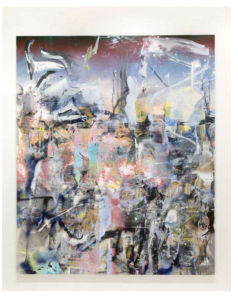
"Liam Everett, Untitled (Titan and Rhea), 2018" All rights reserved.