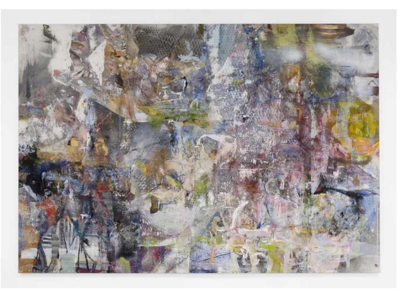
Liam Everett. Untitled (Cloghanmore), 2016. Oil, acrylic, salt, alcohol on gessoed vinyl. 198,1 x 284,5 cm. View of the exhibition © Liam Everett. Photo. Julie Joubert & archives kamel mennour. Courtesy the artist and kamel mennour, Paris/London

DV : At Kamel Mennour Gallery you described your painting process to me. It was a pretty "complicated" or "different" approach. Can you explain it to me again?