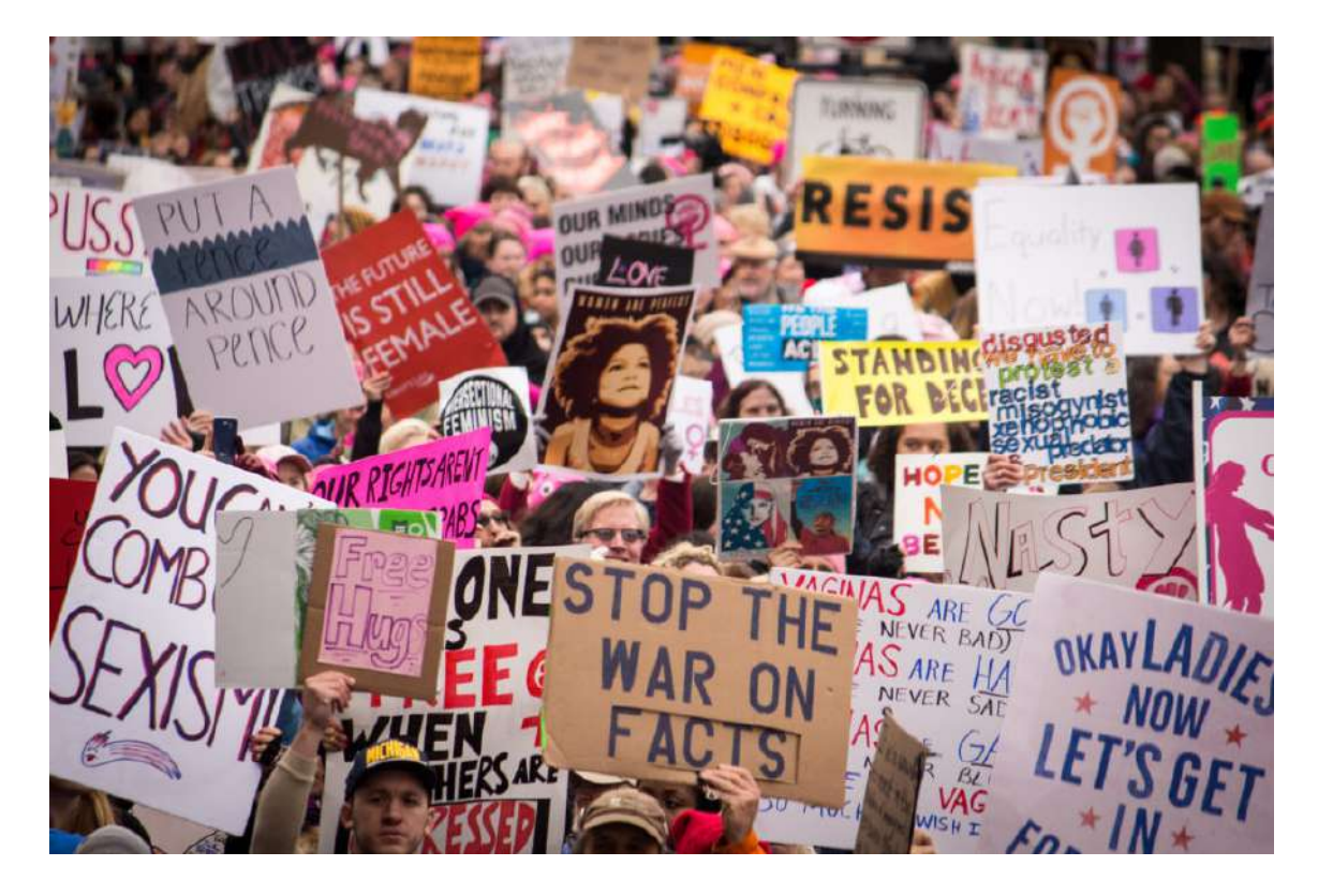
Women's March on Washington, January 21, 2017; photo: David Atkinson

Like Trump's America, RWBs clumsily makes its presence known. We are confronted by the sculpture's gargantuan size, out of proportion to its surroundings, hinting at the perception of the United States elsewhere in the world. Like our new president, RWBs appears threatening, dangerous, and unpredictable. (Presciently, Larner included a few red power ties among the tubes' sleeves.) In direct opposition to the sculpture, Everett's Untitled becomes a flag — not of a specific country, ethnicity, or religion, but one that represents the unrepresented, a flag of defiance and dissent. The gauzy material looks distressed and worn, and its colors have bled. It has been to battle but is still standing strong. Though pinned against the gallery wall, Untitled is positioned in direct resistance to the oversize, tangled mess of American imperialism and aggression.