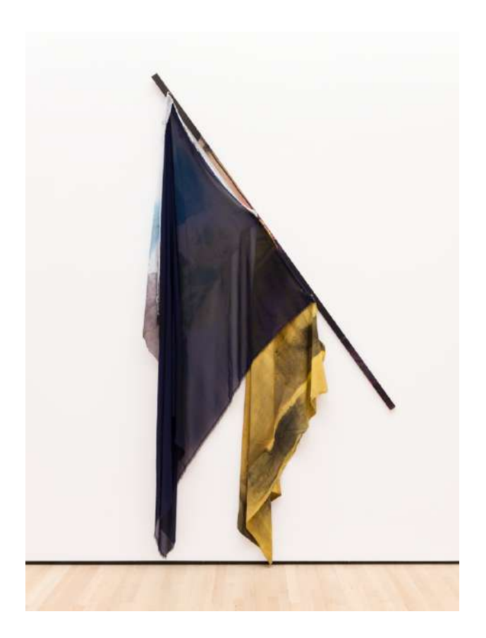
Liam Everett, Untitled , 2012; collection SFMOMA, Accessions Committee Fund purchase; © Liam Everett

Larner outfitted each of the tubes with a hand-sewn red, white, and blue fabric sleeve — a reference, she has explained, to flag-draped coffins, cheerleading outfits, gas-station banners, and other aspects of our everyday lives that are imbued with concepts of patriotism, nationalistic fervor, and American hegemony.