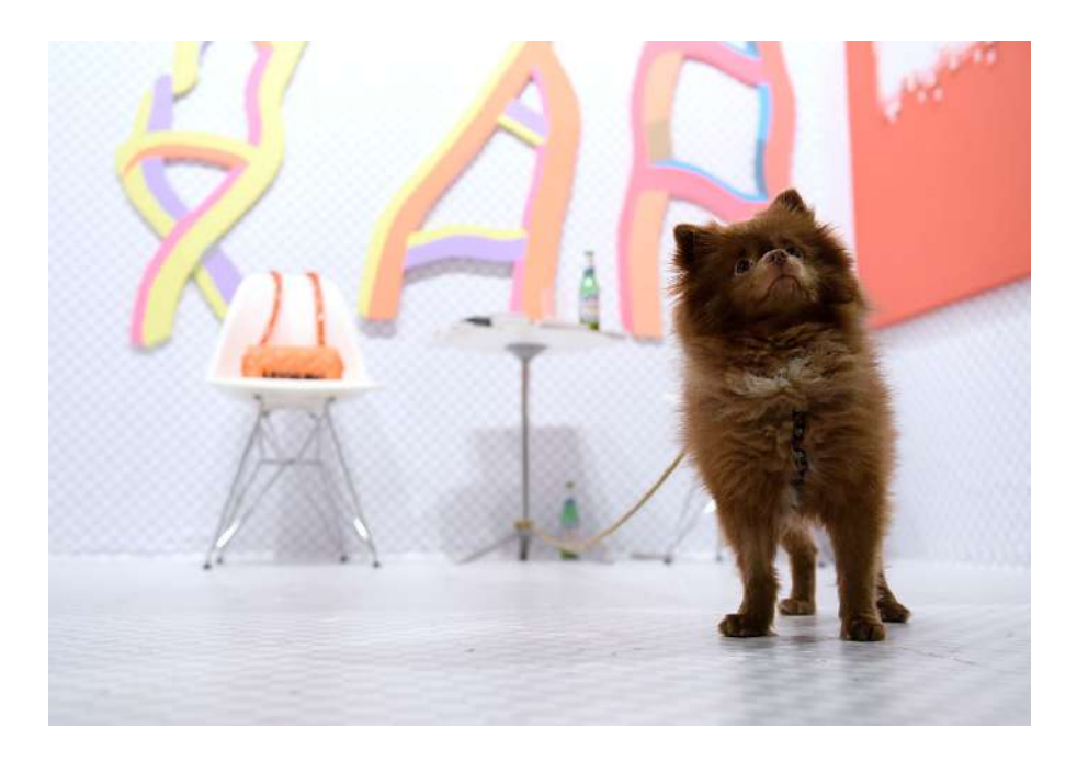
SANTA MONICA, CA – JANUARY 28: A dog poses during the Art Los Angeles Contemporary 2016 Opening Night at Barker Hangar on January 28, 2016 in Santa Monica, California.