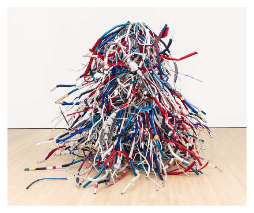
Liz Larner, RWBs , 2005; collection SFMOMA, Accessions Committee Fund purchase; © Liz Larner