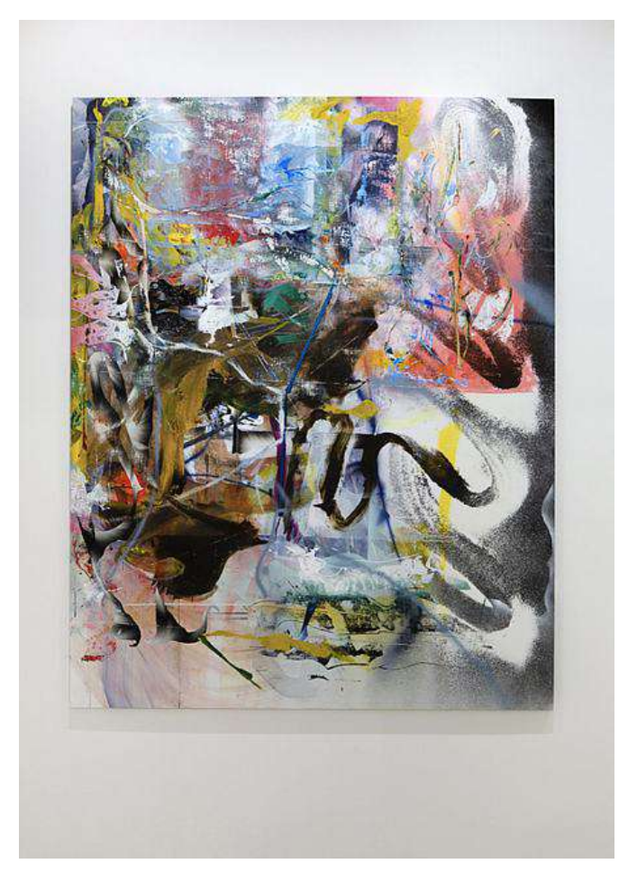
"Liam Everett, Untitled (lethe-aletheia), 2019" All rights reserved.