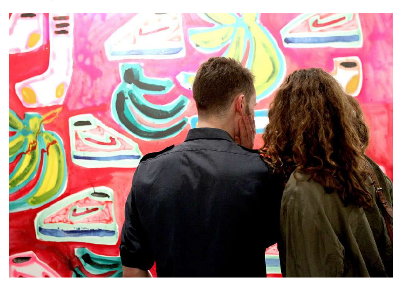
Art Los Angeles Contemporary 2016.

Notwithstanding a preponderance of vibrantly-colored abstract works that are custom-designed for West Coast walls, everything about the seventh edition of Art Los Angeles Contemporary feels like the right fit, from the volume of work shown, to an easily navigable open floor plan, to the alluring mix of US and international dealers with a range on material on view.