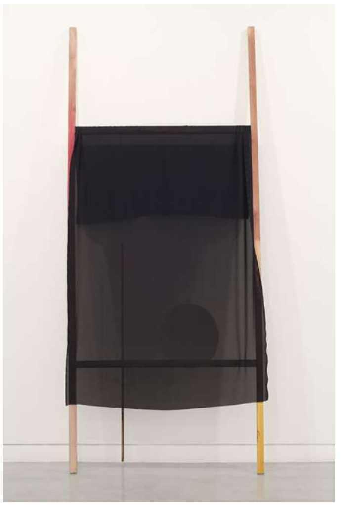
Always inside a world where the light discloses the structure that shows us the 'movement' of always falling, 2012, mixed media, 244 x 97 cm

Liam Everett's art stands, first and foremost, as testament to the processes of its making. In spite of their rich optical pleasures, his art works claim a solemn dignity as battered survivors of previous punishments. It is fun to imagine just what these wild, intense forces might have entailed.