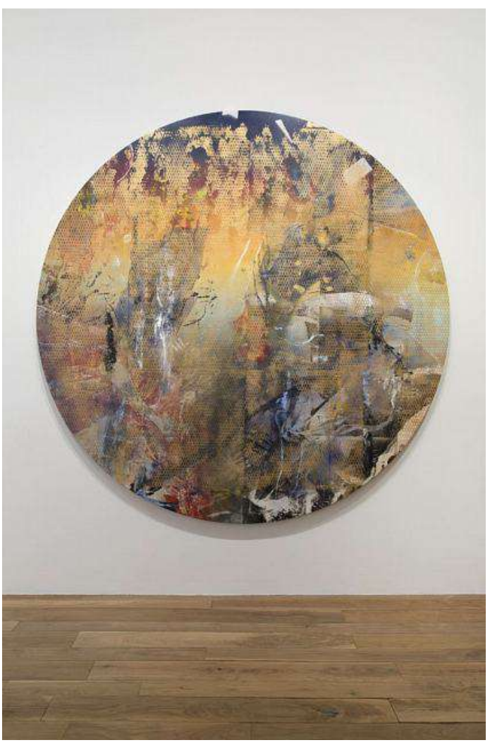
"Liam Everett, Untitled (Choreus), 2018" All rights reserved.