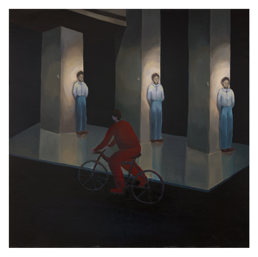
Lyn Liu, Traverser, 2022, oil on linen, 40 x 40 inches.

Burden (2022) is simple enough on first glance: a set of three pieces of tableware—a plate, on top of which rests a shallow dish. Resting on the second piece of chinaware is a bowl. The color of all three pieces is a muted gray. The objects occur within a very dark frame, which adds to the mystery facing us. Why would the artist give so simple a subject the resonant title Burden? It is difficult to say, but so suggestive a name, along with the enigmatic nature of the dishes, whose purpose is beyond us, feels enigmatic, even dark—this despite the simple nature of the image. Big-Hand Smokers (2022) depicts two smokers, a few feet apart in a large, dark empty space. Both of the smokers are women; the person on the left, wearing a dark overcoat, faces away from us; we see only a small part of the right side of her face. It looks like the woman on the right is intent on keeping her cigarette going; she wears a look of concentration, cupping her hands around the smoke. This person also, strangely, wears a pierrot-like costume. Both figures have abnormally large hands. Again this Allegorical meaning is suggested but is impossible to specify.