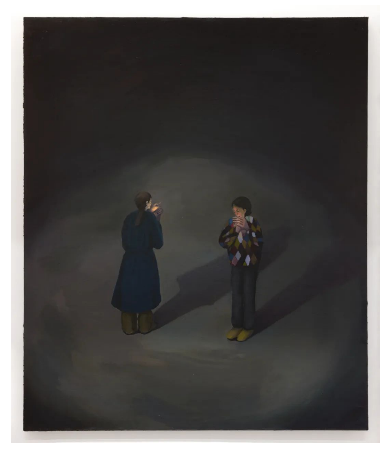
刘佳林, 《大手烟客》(Big-hand Smokers), 2022, 亚麻布油彩, 142.2 x 116.8 cm

接下来:刘佳林正忙着搬新工作室,准备下一个展览。她现在的创作尺幅越来越大,最近的几张草稿同样关注人与人交往的平衡点。虽然她对其它媒介也很感兴趣,但现在一心想先完成手上的绘画作品。