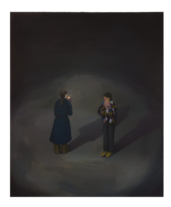
Lyn Liu, Big-hand smokers (2022).